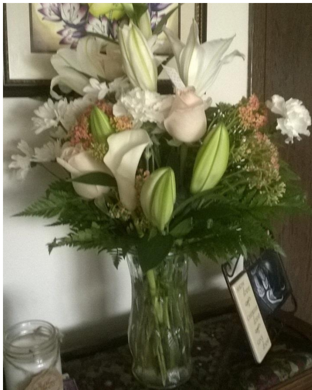
One Sided/ One Color