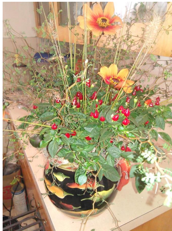
Full/Multiple colors/Fine Texture